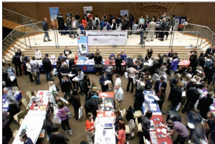
▲ A great turn out for the 2010 College Day event.

Last year, more than 4,000 UK students studied in the US at the undergraduate level. Why do so many students cross the Atlantic for their studies? In a recent survey, we found British students were most attracted to the US for several top reasons. These include the ability to choose from a wide range of universities