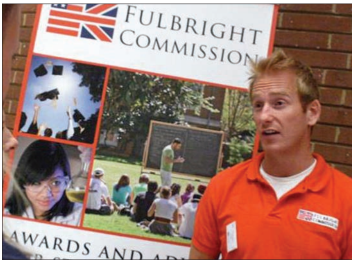
▲ Advisors will be on hand throughout the event.

Having the flexibility to explore their academic interests is especially appealing for students who feel pinned-down by their A-level choices or who are not sure what they would like to study. US universities teach under what is called the liberal arts philosophy, meaning students take classes from a variety of subjects before specialising in their major field of study.